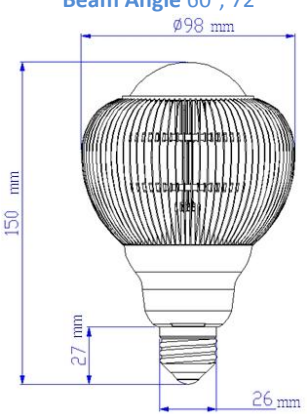
E26/27(EURO) Beam Angle 60°, 72°