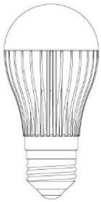
Design E26/24 (US)