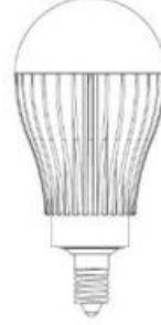
Design E14 (US)