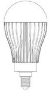
Design E14 (EURO)