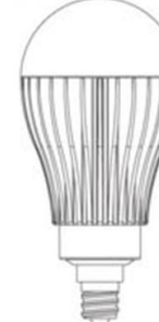
Design E12 (EURO)