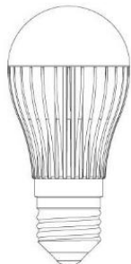
Design E26/27 (EURO)